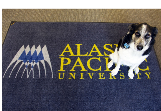
Piper, Resident Floofer

“I did my own research and was lucky enough to hire an assistant with Aquatic experience. When I took over, I was running 12 year old TMI equipment. While this was a testament to the equipment itself, as, with TMI's help, I was able to keep it working, we were running everything manually. This presented me with a valuable learning experience because if I had inherited the equipment we currently have, I would not have learnt nearly as much. Most of my information came from TMI and the other contractors that worked on the quarter million dollar renovation at the end of 2020.”